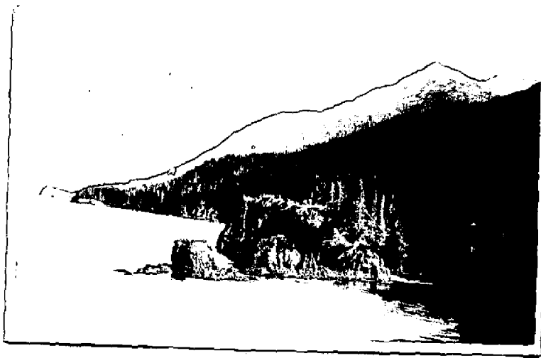
Photograph Showing Shore-line East of Gull Rock.