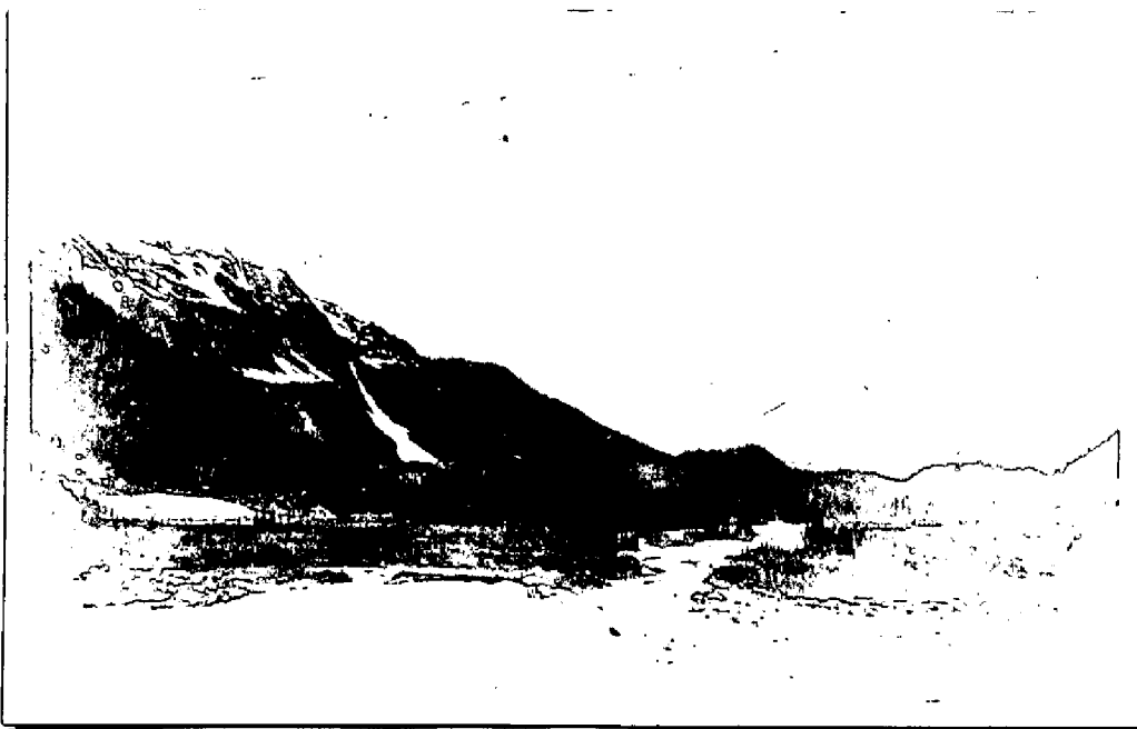
Looking to-wards Passage Canal from Poe Glacier.