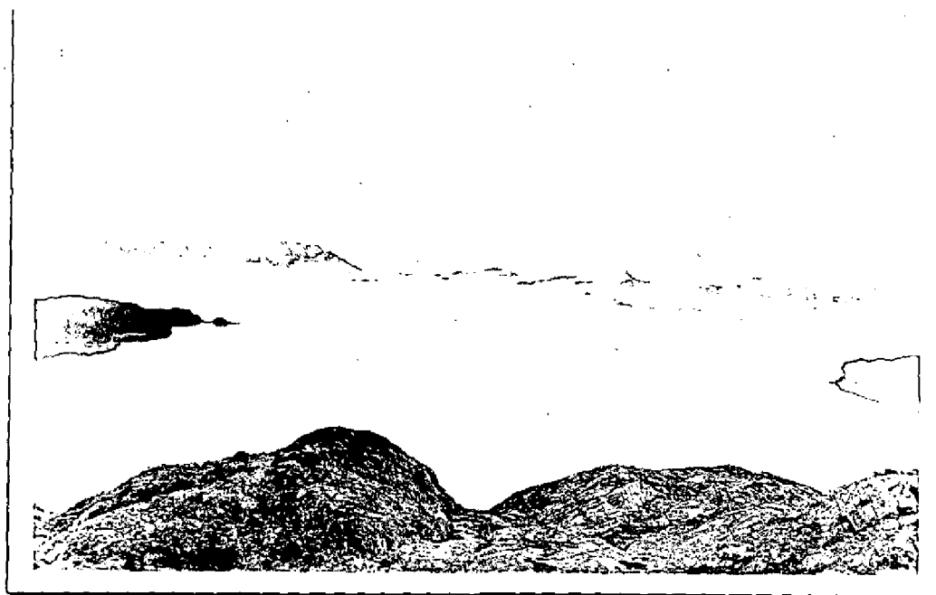
Looking East - out of Passage Canal. across Port Wells and out Perry Island Passage.

Station Ridge is on the north slope of the ridge between Passage Canal and Blackstone Bay, at an elevation of 1140 feet, and about half a mile from Decision Point. A trail to the station is shown on the sheet. Two prints taken at this station, looking in two directions, up and down Passage Canal are here shown. A third print shows the signal.