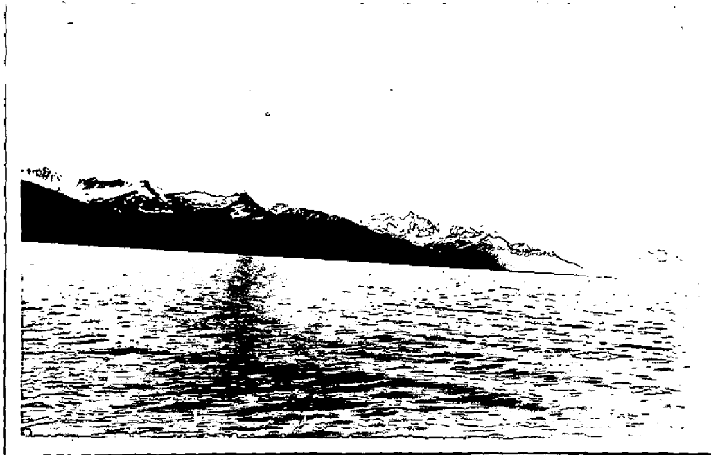
West shore of Port Wells - near entrance.