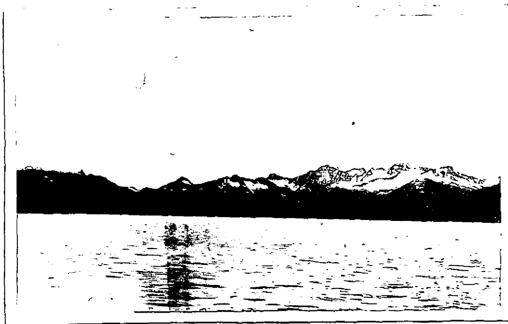
Approach to Passage Canal.