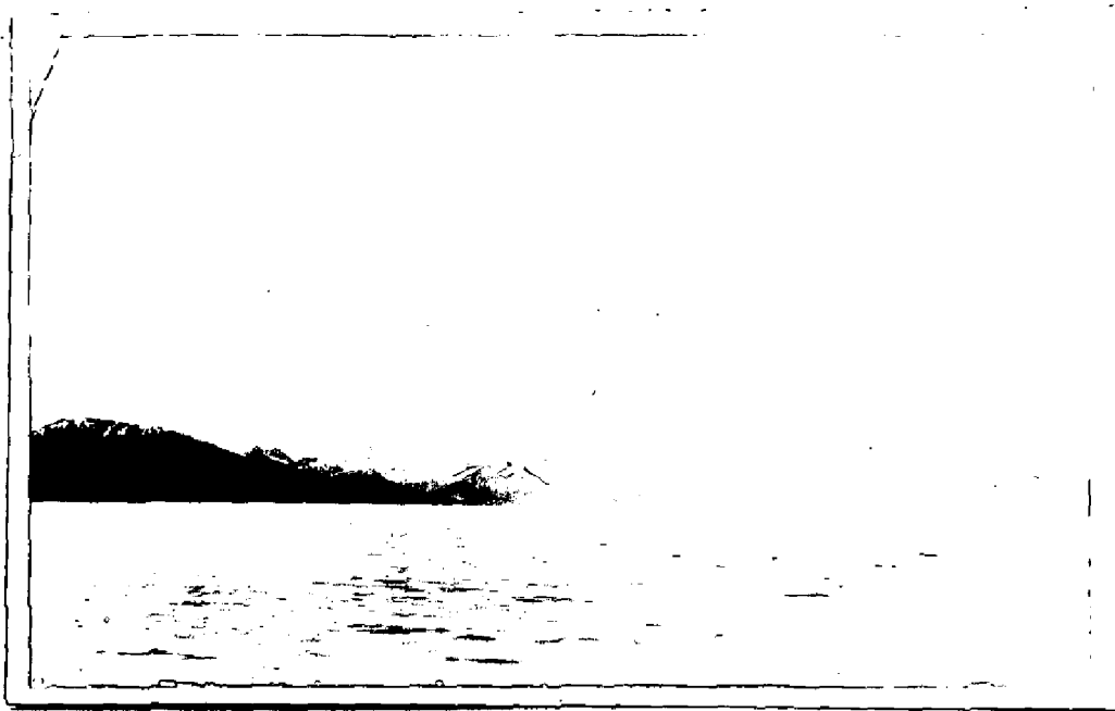
Looking up Port Wells from a point near the entrance to Passage Canal.