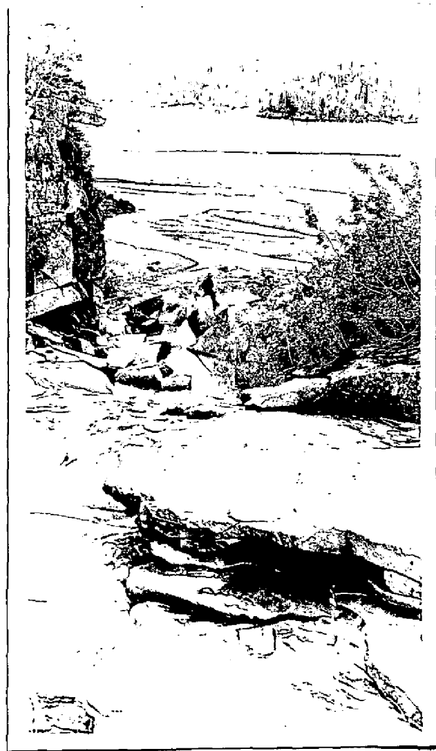
Head of Poe Bay.