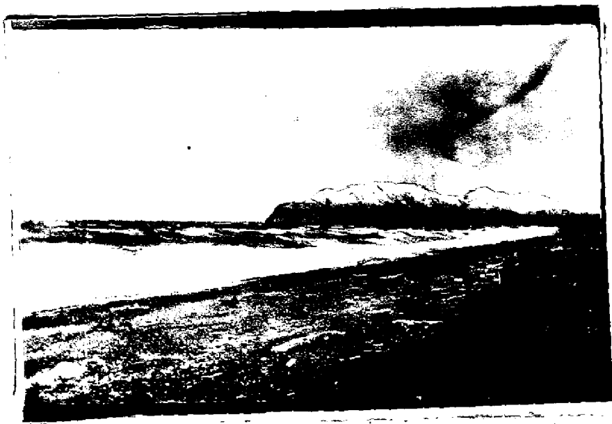
Cape Grant, looking north from the low hill back of signal "Mound".