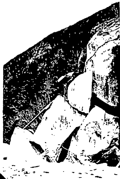
SET UP AT A BOLD.