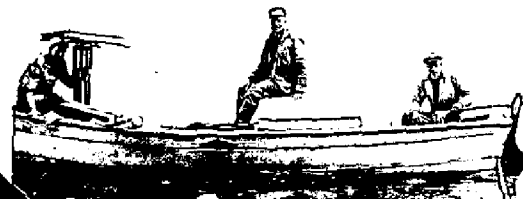
MOTOR GOAT USED BY TOPOGRAPHIC PARTY.