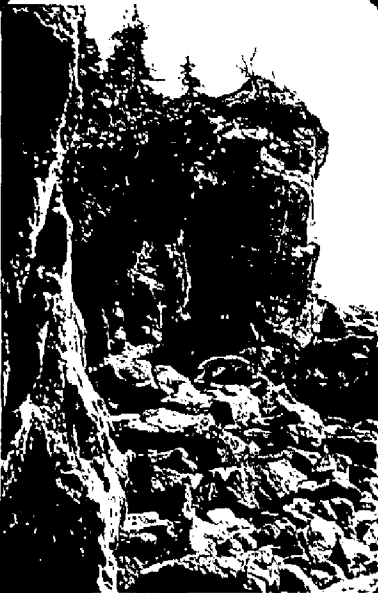
SULLIVAN I NEAR OHE