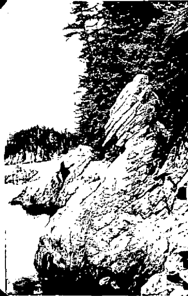
SHORE AT SULLIVAN RK.