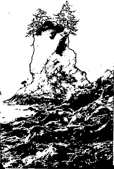
SHORE AT A LIV SULLIVAN I.