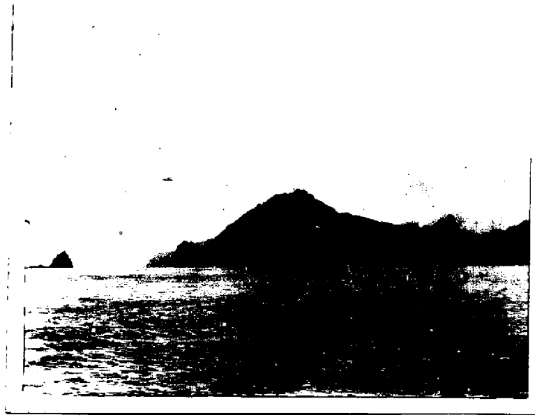
3. Cape Ikplik and Lighthouse Rock as viewed from a point 1/2 mile south of Lighthouse Rock.