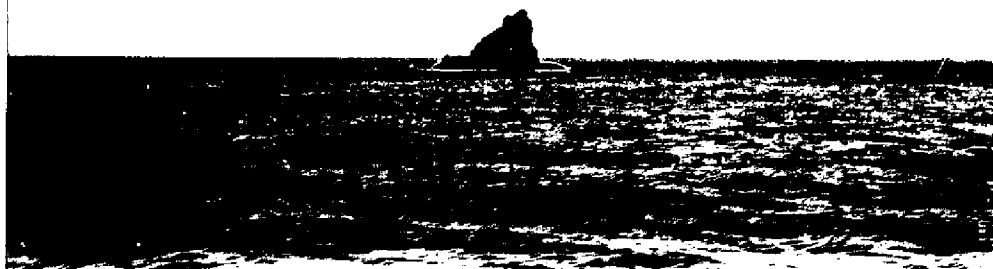
1. Sail Rock as seen from a point \frac{3}{4} mile due east.