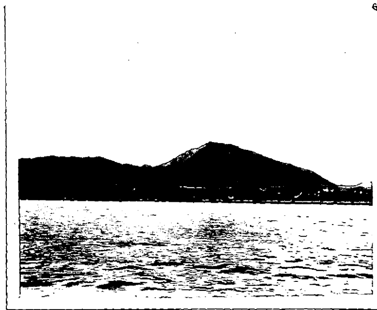
6. Anvil Mountain as seen from a point 1 mile south of signal Ole.