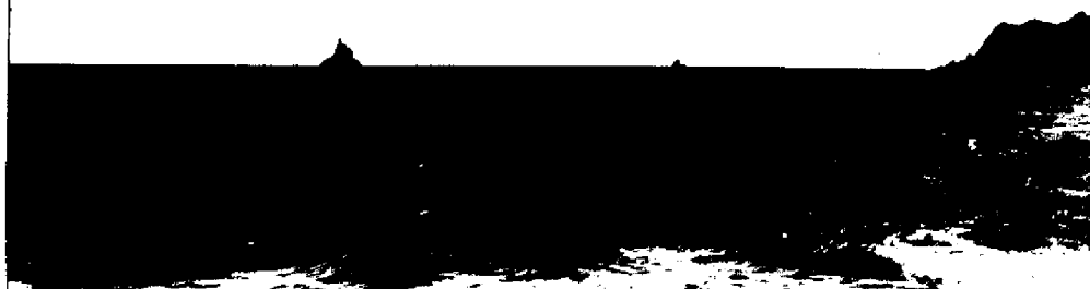
2. Sail Rock, Tombstone Rock, and Cape middle as seen from a point about \frac{3}{4} mile W.N. W. (true) from Lighthouse Rock.