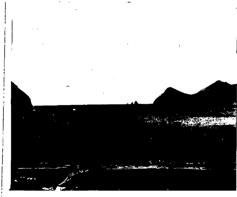
4. Bear Rocks as pictured from signal Shack on the east side of Bumble Bay, distant 2 miles.