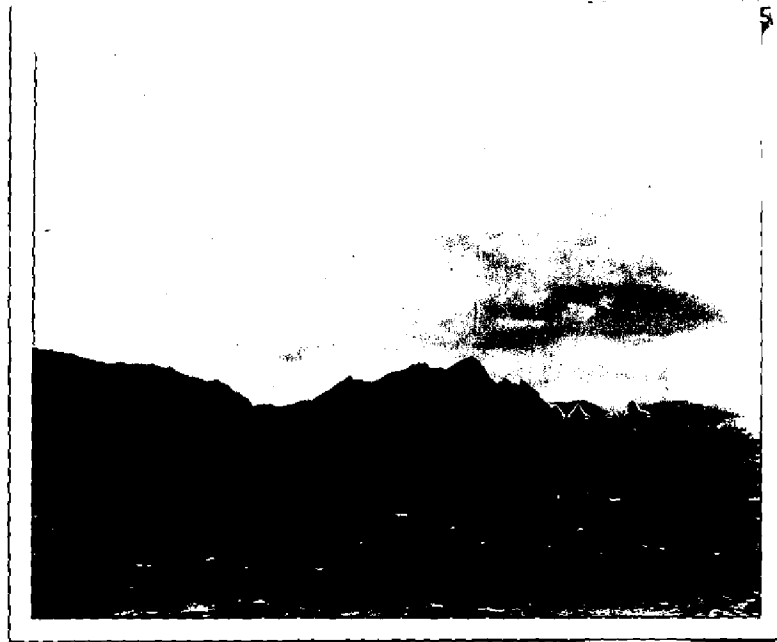
5. Pillar Rocks as seen at a distance 3/4 mile bearing S.E. (true).