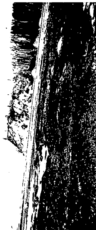
Cape Johnson from the small point to the south