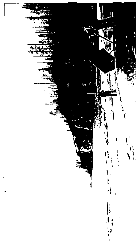
(Teawhit Head from the beach to the east)