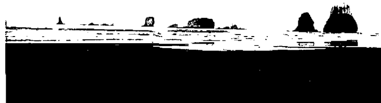
Taken from the beach to the east and north. (Quillayute Needle to left.)