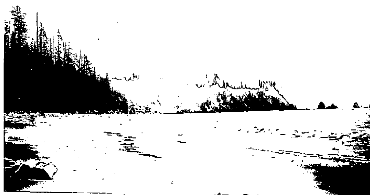
Looking south from the beach east of Teawhit Head.